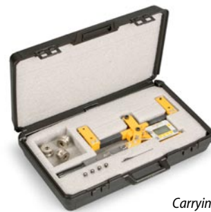
Carrying case available.

Dillon also manufactures highly accurate tensiometers, mechanical dynamometers and crane scales.